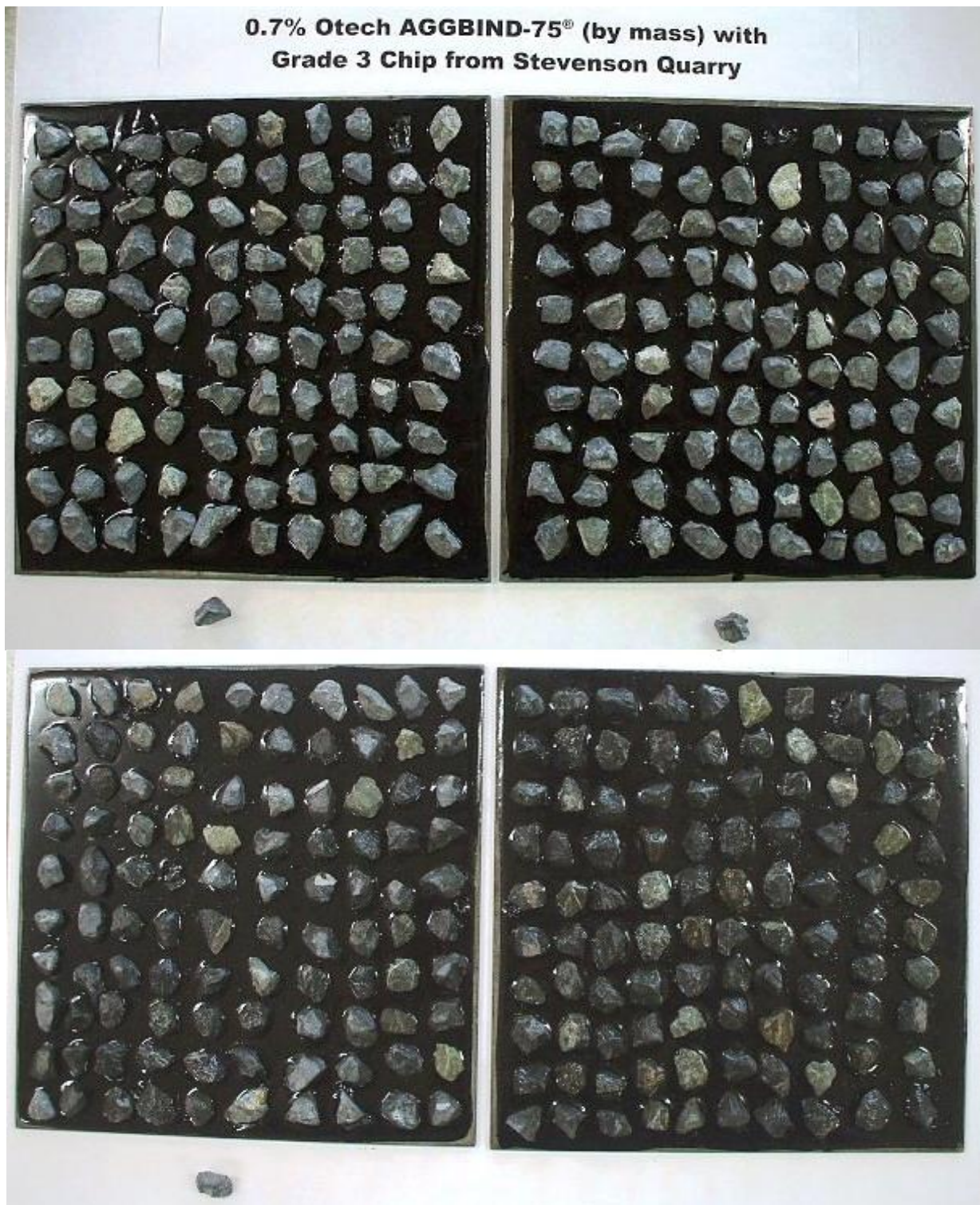
Figure 1. Photograph showing test plates with 180/200 bitumen and 0.7% Otech AGGBIND-75® (by mass) after test was performed. Stevensons Quarry grade 3 chip that was dislodged is arranged below the plates.