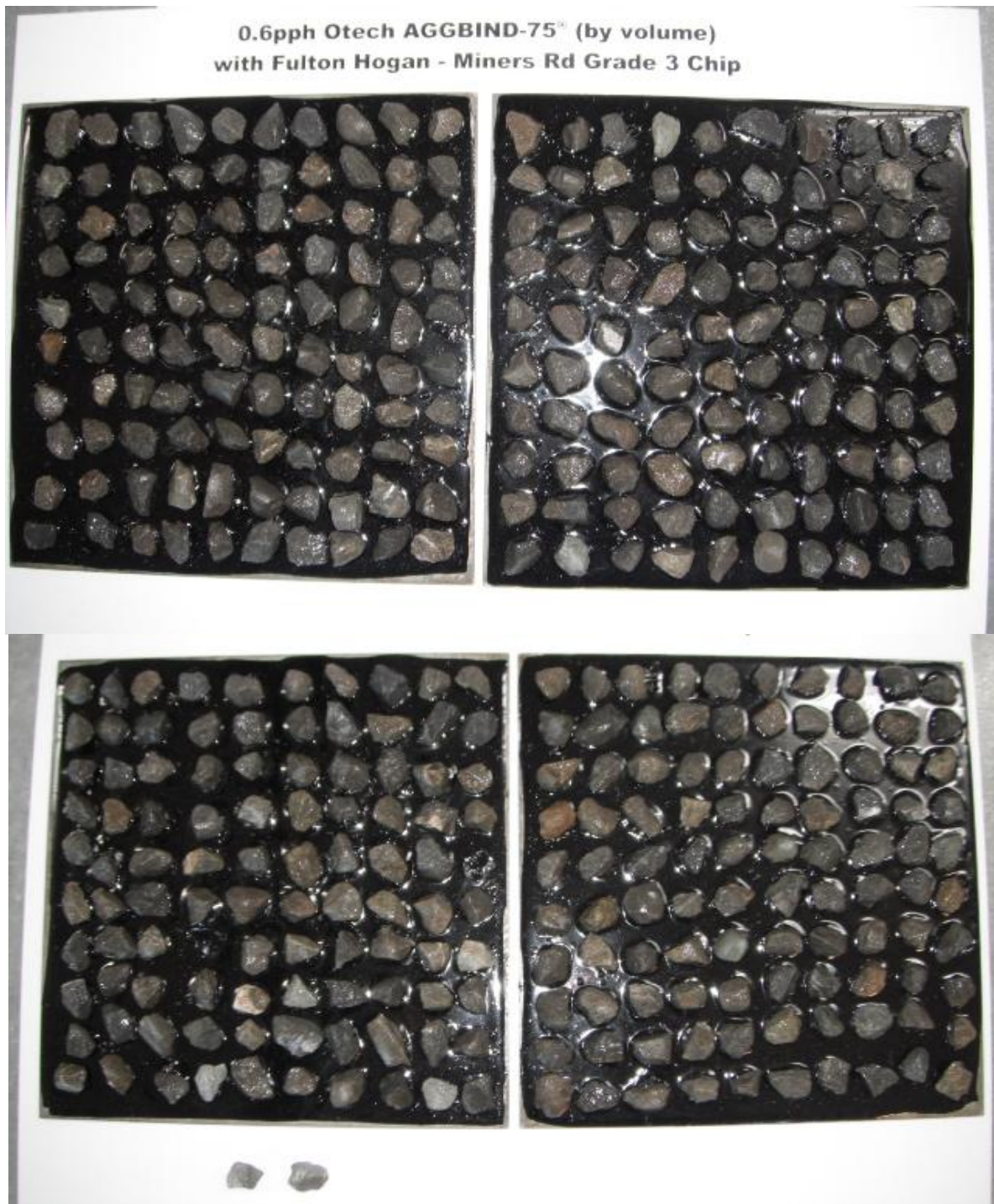
Figure 1. Photograph showing test plates with 180/200 bitumen and 0.6pph Otech AGGBIND-75® (by volume) after test was performed. Fulton Hogan – Miners Rd grade 3 chip that was dislodged is arranged below the plates.